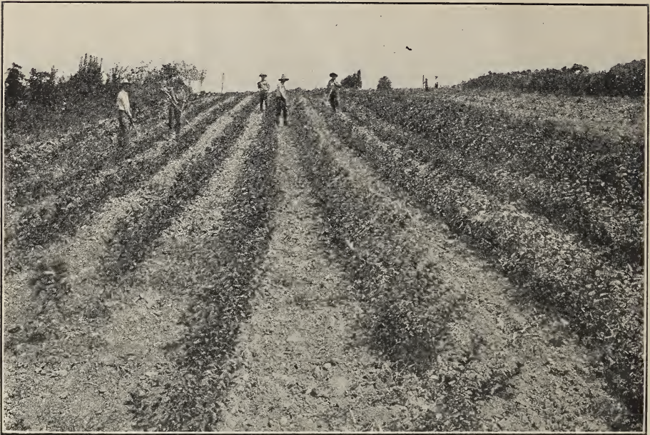
This is one of our blocks of Hydrangeas P. G. and Weigelias, which is making up fine in 12 to 18 inch and 18 to 24 inch grades. Photographed July 10, 1924.